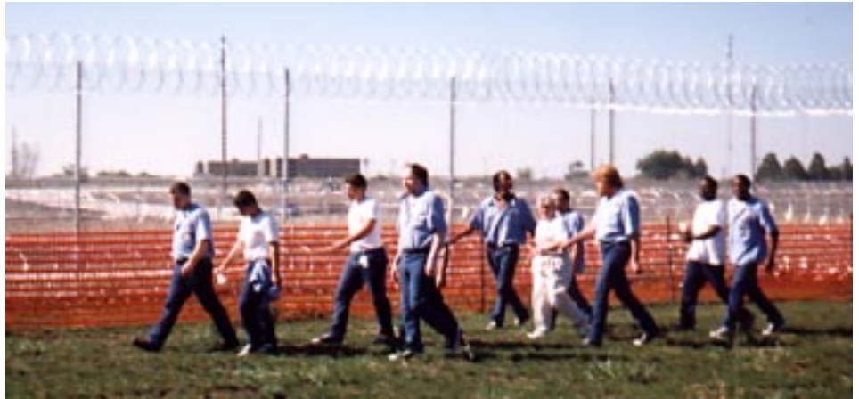
Nine CROP Walkers converse as they walk for world hunger in the 1998 Church World Service CROP Walk.